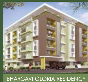
BHARGAVI GLORIA RESIDENCY